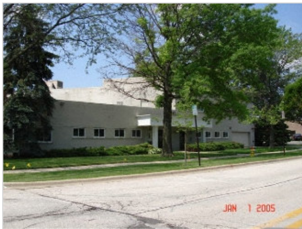
249 Prospect Business Center