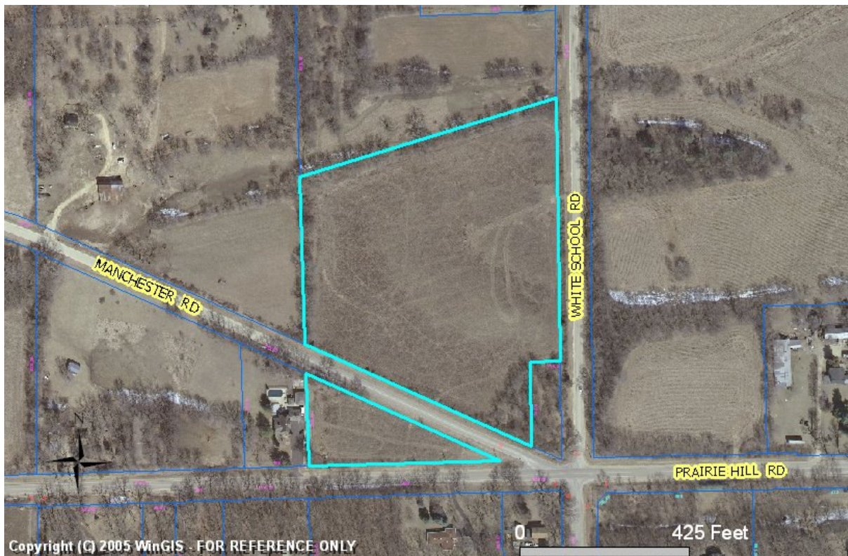
Figure 3 BEFORE Road Realignment, shows entire parcel - now recorded six lots.